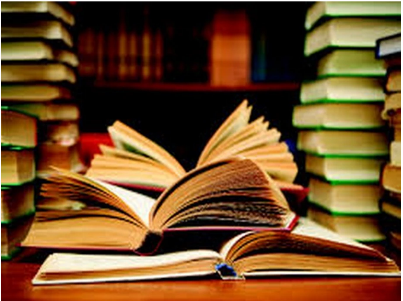
Representative Image

PTI (/pti-stories) | Mumbai | Updated: 22-06-2021 13:22 IST | Created: 22-06-2021 13:04 IST